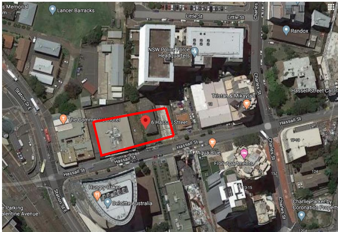
Figure 1 Site Location & Aerial Photograph

The project is located at 2-6 Hassall Street Parramatta, is bounded by commercial properties (east and west), Hassall St (south) and NSW Police Force Headquarters (north) shown in red in Figure 1.